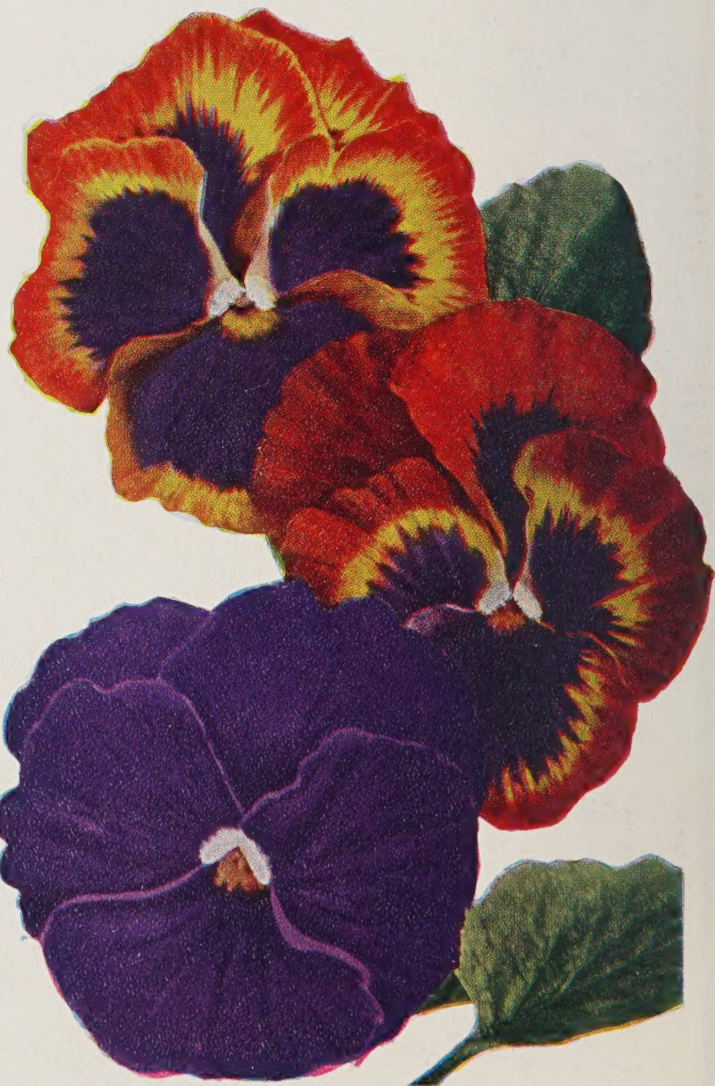
PITZONKA'S PANSY FARM BRISTOL, PENNA.

Educate your family and friends to the fact that they must pick off every dead Pansy blossom they see. This is the way to keep the plants blooming from earliest spring through the hot weather.